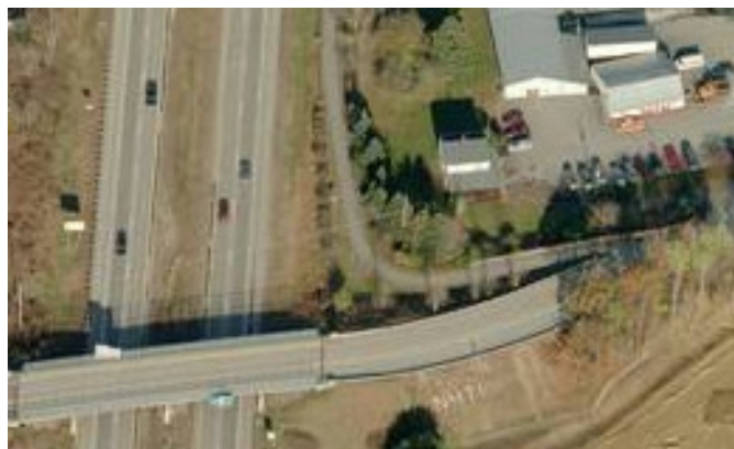
Delta Dr. Bridge and Adjacent Bike Path